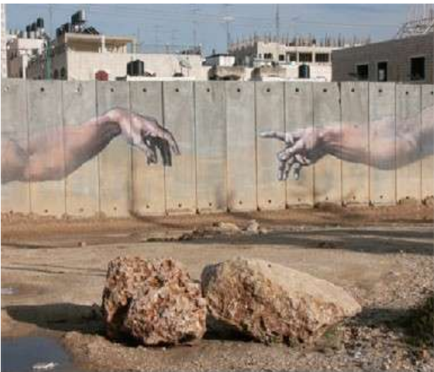
Sleiman Mansour - "Encounter":

"Forcible separation is divisive and destructive. We can build a wall around ourselves and the rest of the world will ignore us and carry on. The only way to resolve conflict is through discussion and unbiased compromise."